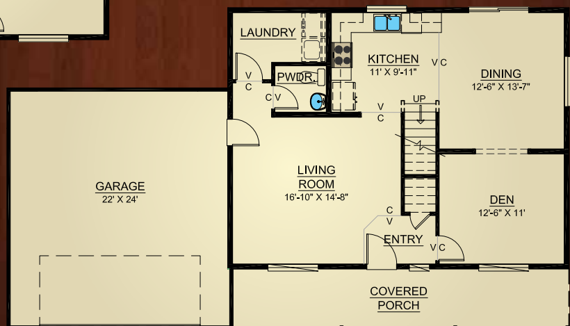
◀ 56'-0" ▶ FIRST FLOOR

Plan | 1768L Living Area | 1768 sq ft Bedrooms | 3 + Den Baths | 2-1/2 2 Car Garage