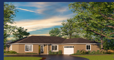
Hip Roof Elevation