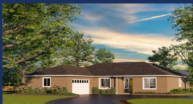
Hip Roof Elevation